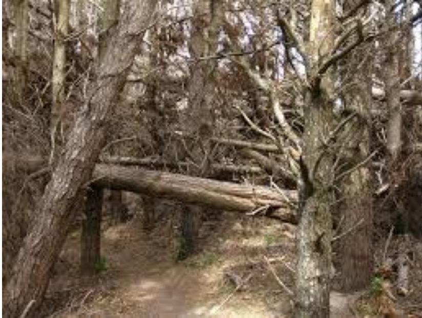
There were plenty of fallen trees.