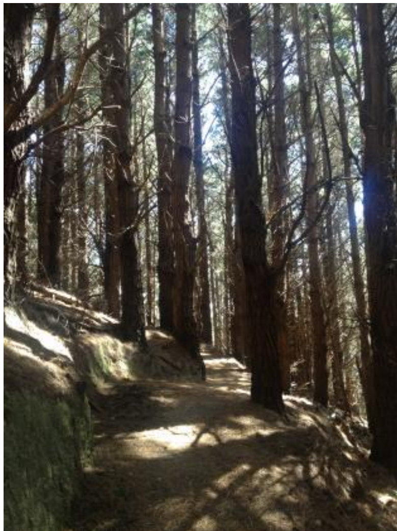
The pines were a bit steep in places.